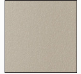
Marvailr Beige 1